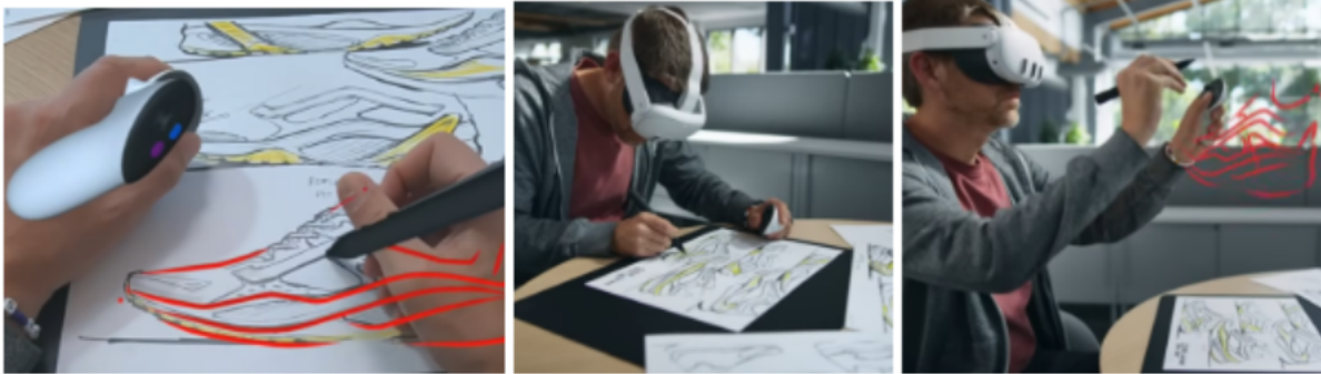
Fig. 1. Using MX Ink on a 2D planar surface in Gravity Sketch, and then transferring that 2D content to 3D.

Pen-based styling design of 3D geometry using 2D concept sketches is a widely used technique [5]. Figure 1 shows such an example using the Gravity Sketch app [14]. In this example, the designer traces key lines over traditional 2D paper sketches and then brings this content to a 3D modeling environment for further development and refinement.